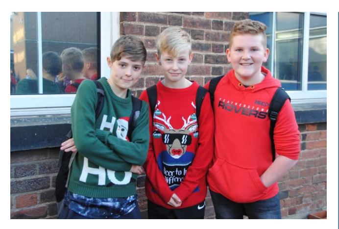
Christmas Jumper Day - 15th December

Students and staff were allowed to dress down on the last day of term, paying £1 for the privilege. A total of £634 was raised and the funds were split equally between Pontefract Food Bank and CRY (Cardiac Risk in the Young).